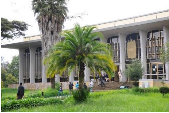
Addis Ababa University 12