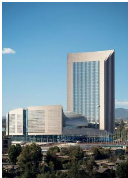
The African Union Headquarters Building 19

According to the 2018 Global Go To Think Tank Index Report 20 , there are 26 official think tanks established in Ethiopia, which ranked Ethiopia at the seventh place of African countries with most think tanks.