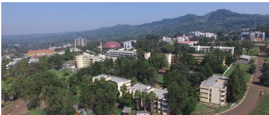
Jimma University 13

As the table above shows, there are currently 36 public tertiary knowledge institutes. Until 2000, there were almost only public ones. Since then, the number of private universities has rapidly grown, such as the total number of students, due to population growth, rising income and increasing numbers of students completing secondary education. In order to welcome these new students, 24 new universities were started, and in ever more of Ethiopia's regions 14 . In 2015, public universities enrolled 85% of undergraduate students. Next to public universities, there are 32 public teacher training colleges, as well as other public institutions from different government ministries. Public universities are scattered over the country. Ethiopia's oldest university is Addis Ababa University, with 70 undergraduate and 293 graduate programs. In number of students, there are 6 public universities with more than 40,000 students (Addis Ababa University, Arba Minch University, Bahir Dar University, University of Gondar, Hawassa University and Jimma University), located in different regions. The biggest one is Bahir Dar University, with more than 55,000 students. Only two of the private universities have a comparable number of students. Most public universities offer bachelors' and diploma/certificate courses, but also masters programmes. However, only a few are research-oriented with doctorate programmes. These