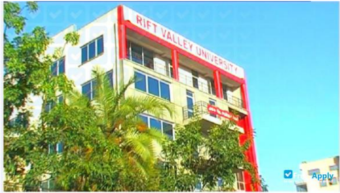
Rift Valley University College 15

There are currently 95 private universities or other tertiary knowledge institutions in Ethiopia. Some Christian theological private institutes already existed before 1990, but the large majority of the private institutes appeared from the 2000s onwards, and their expansion has been very fast. However, the number of students in private universities is still relatively low (15%). With more than 45,000 students, the Rift Valley University (2000) is Ethiopia's biggest private university, followed by the New Generation University College (2002) with almost the same number of students. Compared to public universities, private ones are offering less complete and less varied programmes. They offer bachelor/diploma programs, but only a few offer master's programmes and none PhDs. Colleges especially deal with applied sciences (e.g., computer science) and professional tertiary courses (e.g., business management). Many are commercially oriented and teaching applied sciences.