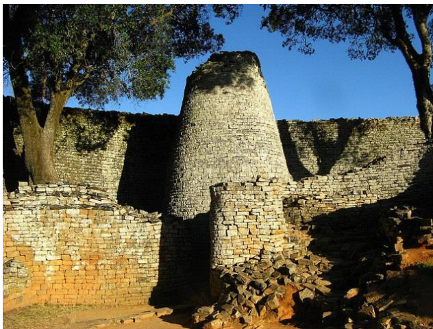
Great Zimbabwe Museum 10

Most museums in Zimbabwe are historical cultural museums, and with locations in various parts of the country. In table 9 we give a list of 23 museums in Zimbabwe.