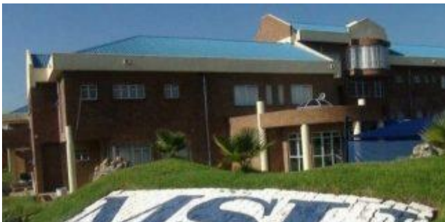
Midlands State University 8

The regional distribution of Zimbabwe's tertiary knowledge institutions shows a dominance in absolute and relative numbers in Bulawayo and Harare, but after 1991 the Zimbabwean government established at least one public higher education institution in each of the ten regions, with Matabeleland South and Mashonaland East being the latest additions, in 2012 and 2017 respectively. Zimbabwe has relatively few private tertiary institutions, and the large majority of the Zimbabwean students study at public institutions.