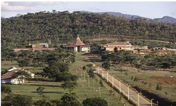
Africa University 7