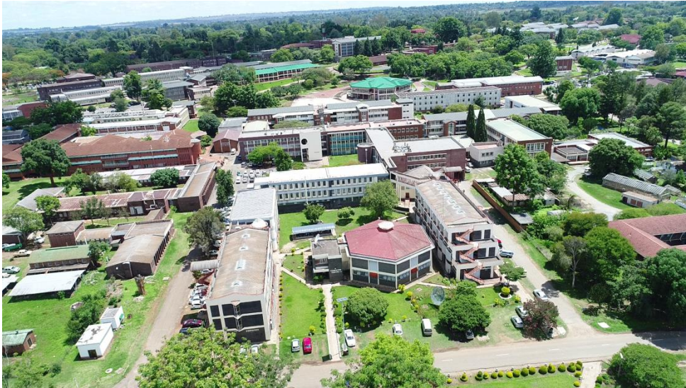
University of Zimbabwe 6