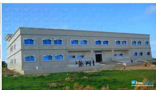
Kismayo (private) University 17

Most universities offer bachelors' and diploma/certificate courses, less offer master's programs. Only the universities of Mogadishu and of Hargeisa (Somaliland) are research-oriented with doctorate programs (in science, business and Sharia studies). Many universities offer bachelor programs in almost all faculties. However, inside each, the variety of programs and courses is very limited. A general tendency is also to deal more with applied sciences, professional tertiary courses and Sharia studies and law. Most of Somalia's postgraduate institutions offer these programmes. Since the last 20 years, major progress was made in Somalia's tertiary education sector. However, the study possibilities remain little varied and underdeveloped. Overall quality also has to be increased. Issues linked to instabilities persist: young Somali are less able to attend school and then finish secondary school and a hundred thousand students are displaced. Armed conflict also lead to university closures. Lafoole University (Lafoole, near Mogadishu) was closed due to linked damages of its infrastructure, and difficulties of holding class and acquiring resources 18 .