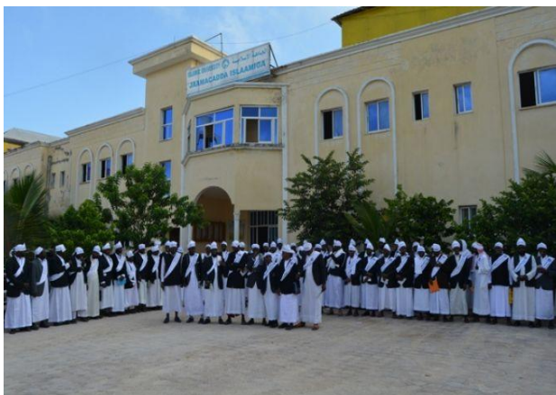
Islamic (private) University 11

In 1953 Somalia's first university (Somali National University) was established, which was and is a public institution. It is only 40 years later that a second one started (1993). The Indian Ocean University was also the first private university. Since then, the number of universities has grown massively, especially private universities. Because of the lack of public allocations and the absence of a national educational authority, private universities exponentially emerged since 2000. They actually represent more than three-quarters of the total number of tertiary knowledge institutions.