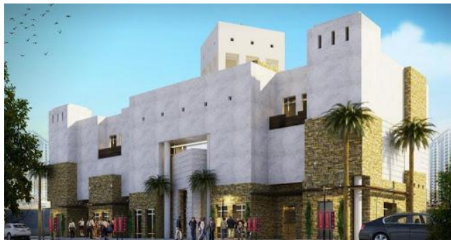
National Museum in Hargeisa 25

There are only two important museum in Somalia. The first one is located in Somalia's capital city Mogadishu and is Somalia's National Museum (National Museum of Somalia) 26 . The second one is Hargeisa Provincial museum in Somaliland. The museums were respectively opened in 1933 and 1977. However, they were closed and then reopened several times because of the armed conflicts. In fact, the last reopening of Hargeisa Provincial Museum was in 2012 and in 2019, the reconstruction of the National Museum of Somalia was completed, after almost 30 years of closure. See table 9 in part 2.