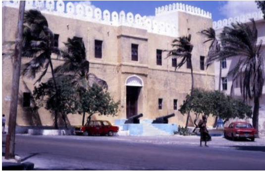
National Museum of Somalia 24