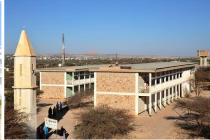
(Public) University of Hargeisa 10

In 1953 Somalia's first university (Somali National University) was established, which was and is a public institution. It is only 40 years later that a second one started (1993). The Indian Ocean University was also the first private university. Since then, the number of universities has grown massively, especially private universities. Because of the lack of public allocations and the absence of a national educational authority, private universities exponentially emerged since 2000. They actually represent more than three-quarters of the total number of tertiary knowledge institutions.