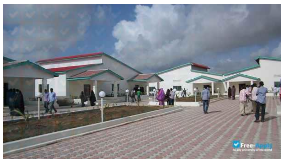
Puntland (public) State University 16

Since 2000, Islam has taken an important place in the tertiary education sector, in private and also public universities. Currently, almost one university out of two is Islamic. This tendency is linked to the rising place of Islam in Somalia and the return to religious law. In this context, countries like Saudi Arabia or Turkey 12 , which has its biggest Embassy in the world in Mogadishu, are investing in Somalia's universities (e.g. Mogadishu University, ranked among African top 1000, was partly funded by Saudi Arabia). Turkey's soft power essentially occurs through their network of secondary schools, encouraging Somali student to continue their studies in Turkey 13 . They also have university-level institutions in Somalia (e.g. Turkiye Diyanet Foundation in Mogadishu). In total, there are 2,000 Somali students pursuing tertiary education in Turkish academic institutions 14 . Since 2017, Turkey trains and prepares Somali Air Forces' officers at Camp TURKSOM, a Turkish military base and National Defence University. The goal is to increase the knowledge level of Somalia's military, so that it can sustain itself 15 .