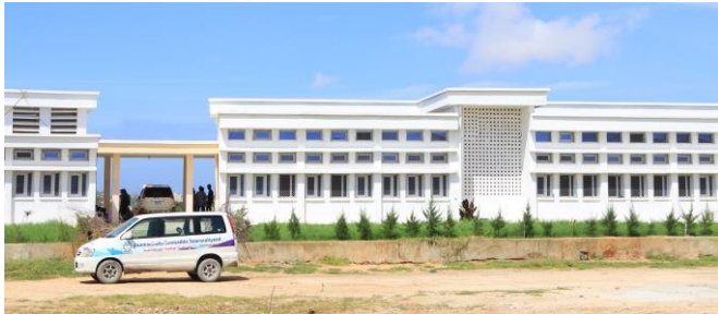
Somali (public) National University 9

At first glance, in this unstable country since decades with civil war, the higher education sector seems relatively well developed. Next to the 55 universities, there are some small colleges and other institutions offering undergraduate (and a few postgraduate) programs. We here decided to focus on universities, because of accreditations. However, most universities are small structures (average of 3,000 students). The number of students is going from 500 students (Kismayo university, and Sanaag University of Science and Technology) to 9,000 students at Somalia's biggest university (University of Somalia). Therefore, the total number of students in Somalia remains low in this country with 67% youth unemployment 8 .