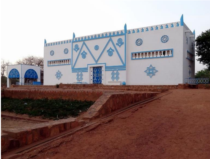
Musée National 6

There are only a few museums in Niger, and these are historical cultural museums, and with locations in various parts of the country. Most of Niger's heritage sites are buildings and markets at Niamey, Zinder and Agadez 7 . Since 1944 there has been a study centre for archaeologie and heritage studies, the Institut Français d'Afrique Noire in Niamey, that was merged in 1974 with the Centre Nigérien de Recherches en Sciences Humaines (CNRSH, 1964), and which is currently called Conservation d'archéologie - Institut de Recherches en Science Humaines, and is part of the University of Niamey 8 . See table 9 in part 2.