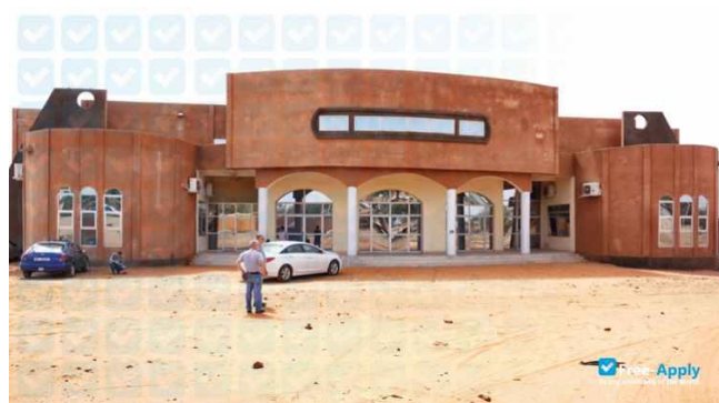
(Public) Université Abdou Moumouni de Niamey 3