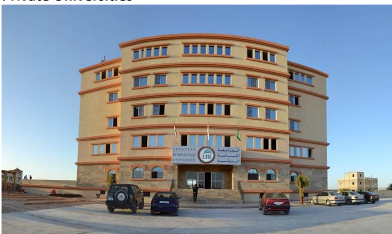
Université Libanaise Internationale en Mauritanie:

https://mr.liu.edu.lb/MauritaniaFrench/annonce/visit/m1.jpg