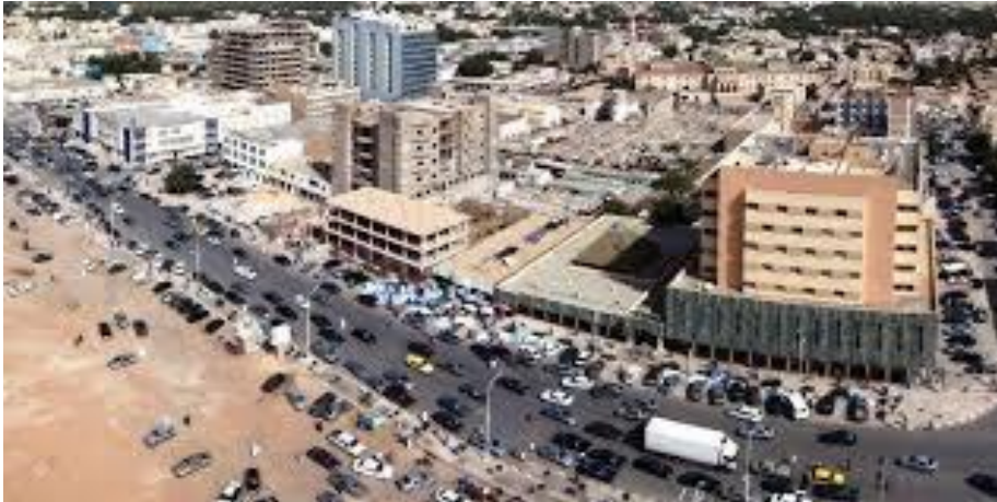
University of Nouakchott

The public universities in Mauritania are as many as the private institutions, which is unusual in African countries. But just like all African countries, the public universities have more students than the privately owned ones. In fact, of the population attending higher-education programs, roughly 10% are in private colleges. The National School of Administration, Journalism and Magistracy is the oldest in the country, founded six years after independence of Mauritania, whereas the biggest is the University of Nouakchott with over 8000 students according to the 4ICU website. These universities (including the private Université Libanaise Internationale en Mauritanie) offer at the very least certificates in various fields of higher-education: medical, business, politics, law, science and technology. The University of Nouakchott is home to the Confucius Institute in Mauritania via a partnership with the Hebei University in China. Besides that, the university offers a possibility of doing a BSc, MSc or PhD programme. This is especially true for PhD at the Université Libanaise Internationale en Mauritanie. There are increasing partnerships between Mauritanian and foreign-based universities, which in the long will help to improve the level of higher education in Mauritania. All universities are localised in the capital city of the country. This limits access to higher-education for those who live elsewhere. See table 5 in part 2.