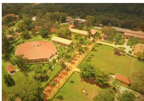
Bugema University 13