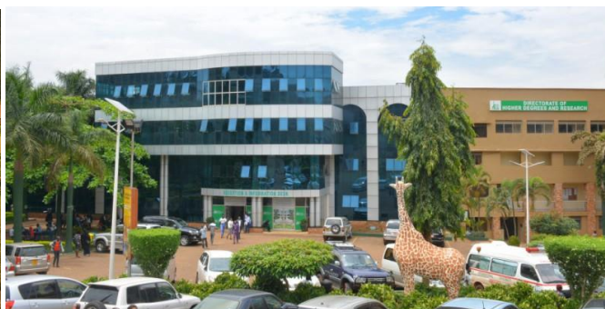
Kampala International University 14

The oldest private (religious) university in Uganda is the Bugema University (1948). Around the 2000s the number of religious private universities started to explode, followed a few years later by many new non-religious private universities. The two biggest private universities right now are the Kampala University with 10,000 students and the Uganda Christian University with also 10,000 students. Most of the private universities have a few thousand students (around 2000). The total estimation of the number of students currently enrolled at a private university in Uganda is 86,000 students. Most of the private universities are located in Kampala. After Kampala the universities are distributed over the country's other big cities, mostly in central and the south-west of Uganda. In the north of Uganda the number of universities is very low historically. Lately these areas are developing their own universities. Two private universities belong to the Top 200 of African universities according to the 4ICU assessment: Kampala International University at the second place in Uganda, and Nr 46 in Africa, and the Ugandan Christian University at the third place in Uganda (and Nr 92 in the Top 200 of Africa). See table 6 in part 2.