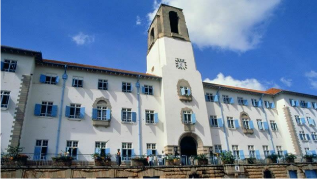
Makerere University 11