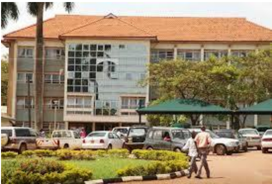
Kyambogo University 12

The number of private universities in Uganda currently is much higher than the number of public universities. The estimated number of students in public universities is more than 108,000 students, whereas the number of enrolled students at a private university is more than 86,000 students. This number is established by adding all the known numbers of students per public university regardless the year a specific number of students was noticed. The biggest public universities in Uganda are the Kyambogo University with more than 50,000 students and the Makerere University in Kampala with more than 40,000 students;