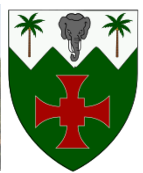
Fourah Bay College<sup>7</sup>

Fourah Bay College is a public university in Freetown, Sierra Leone. Founded on 18 February 1827, it is the first western-style university built in West Africa. It is a constituent college of the University of Sierra Leone (USL).