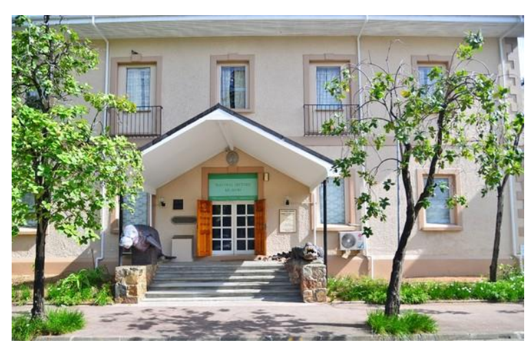
Natural history museum seychelles9

There are four museums in Seychelles, one on Mahé, one on Praslin, one on Silhouette, and one on La Digue.