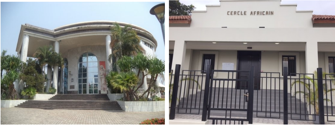
Musée National du Congo (Brazzaville)<sup>10</sup>

Musée Cercle Africain (Pointe-Noire)<sup>11</sup>