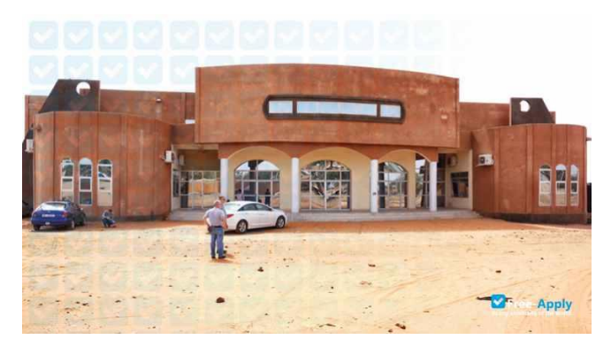
(Public) Université Abdou Moumouni de Niamey<sup>3</sup>