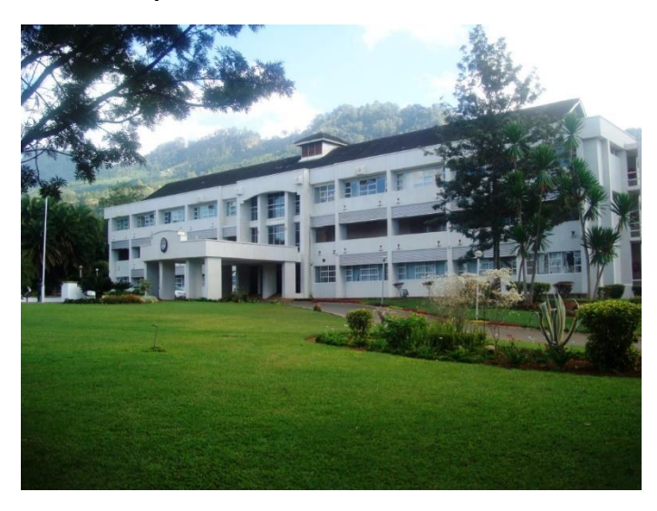
University of Malawi<sup>10</sup>