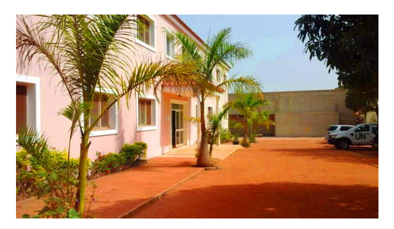
(Private) Universidade Lusófona da Guiné<sup>7</sup>