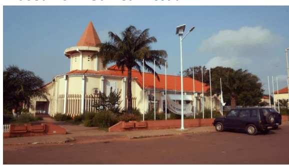
National Ethnographic Museum in Guinea-Bissau<sup>8</sup>

We found two functioning museums in Guinea-Bissau. Both museums in Guinea-Bissau are historical cultural museums. See table 9 in part 2.