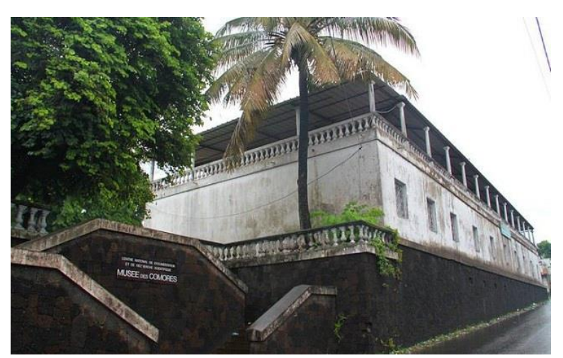
Le musée national des Comores<sup>12</sup>

According to Wikipedia there is one museum in Moroni, Le musée national des Comores, and we found two museums in Mayotte.