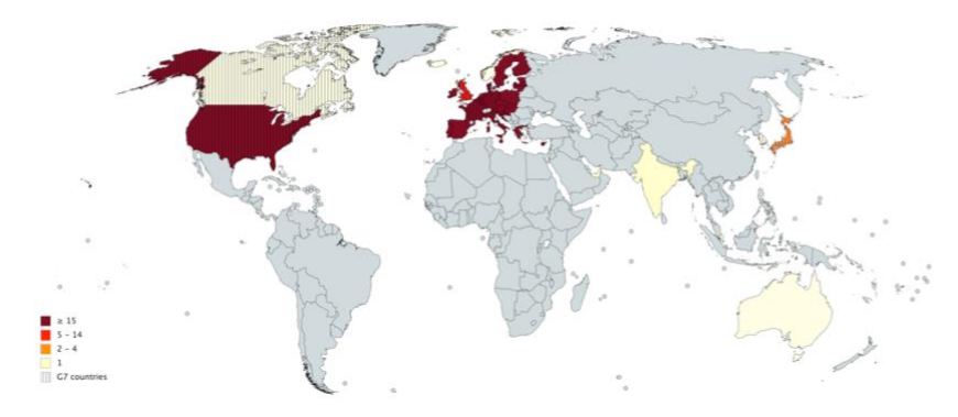
Figure 2: Geographic distribution of issuers of ethical AI guidelines by number of documents released.